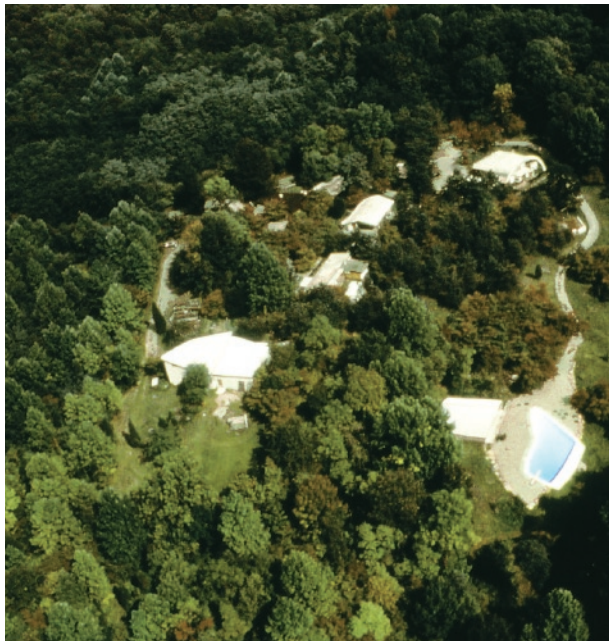
The studio in New Hope, Pennsylvania, nestled deep in the woods